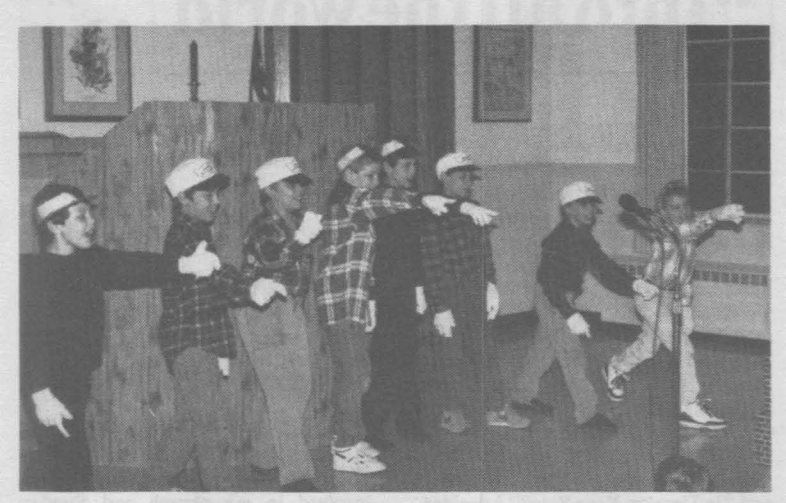
CHILD'S PLAY—The children of Canton, Ohio, entertain the members with a skit about the Tower of Babel.

The church in Canton first met in July 1979 with about 275 in attendance. Canton was one of the first areas to become involved in the in-