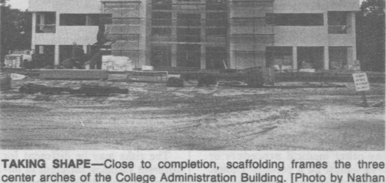
center arches of the College Administration Building.

Occupancy of the language building by the Spanish and Italian departments is expected by Feast