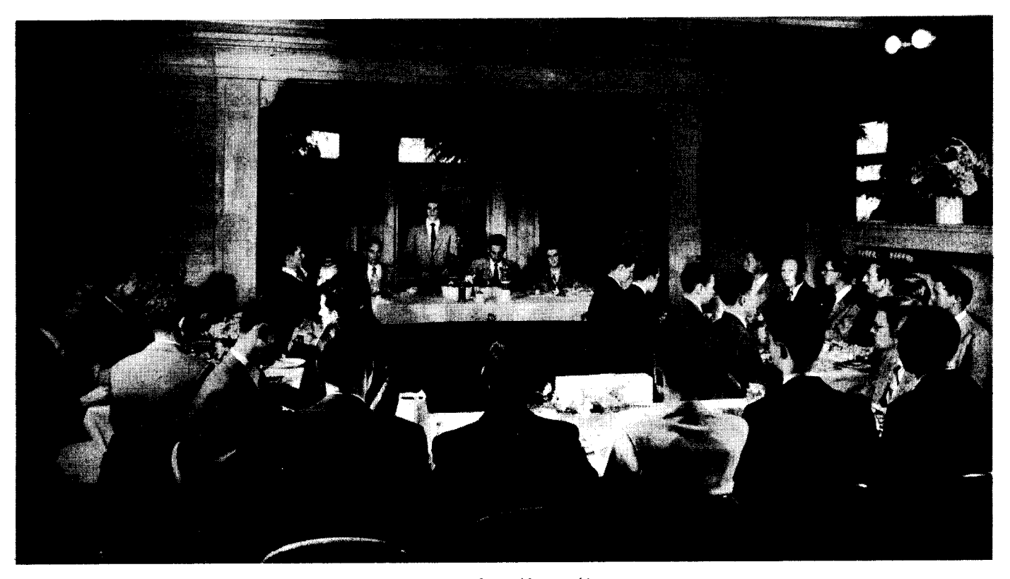
"The Ambassador Club," men's after-dinner speech club, trains men for public speaking; meets every Monday evening.