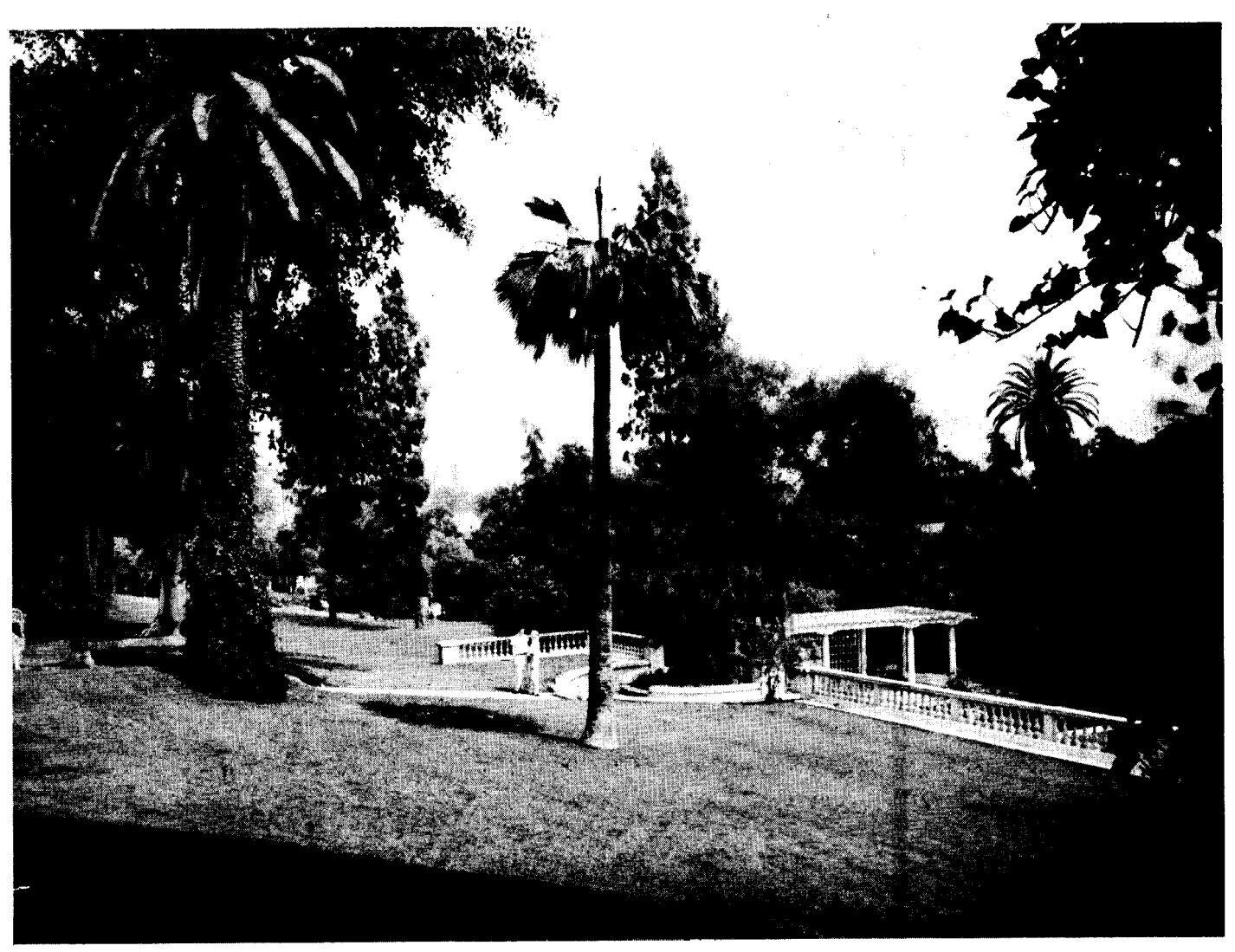
Magnificently landscaped campus grounds of Ambassador College are expansive, restful, beautiful.