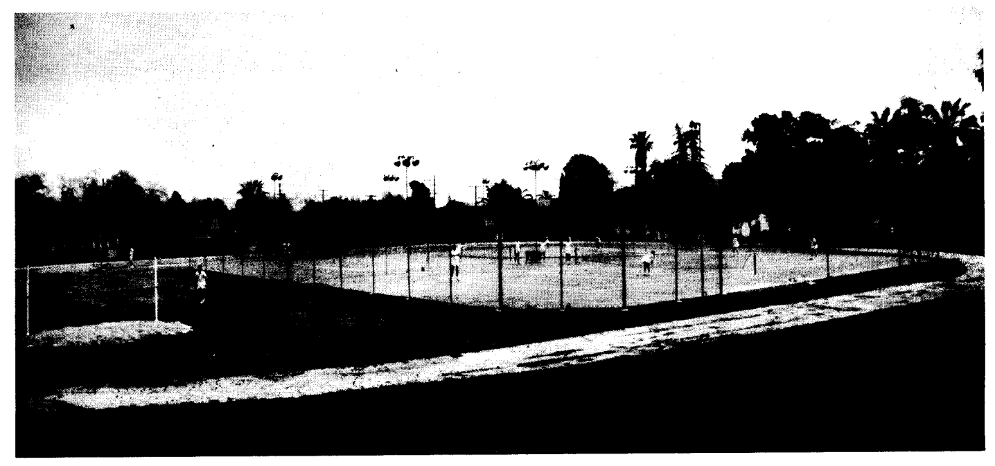
Ambassador College Athletic Field. 42,000-watt flood lights illuminate new modern tennis courts for night play.